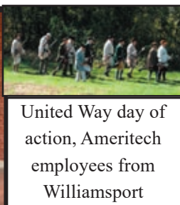
United Way day of action, Ameritech employees from Williamsport