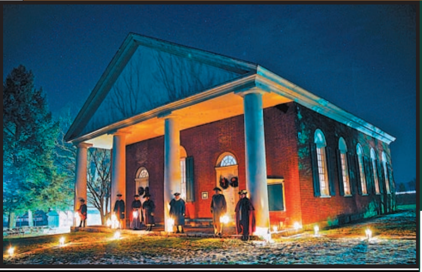
Christmas cards are available to purchase. Please consider using them to send to family and friends. $12.00/box. Please contact Jane Koch.