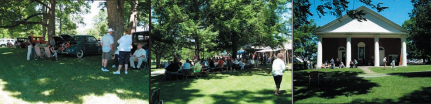
Heritage Days 35th Anniversary

At the present time a special exhibit of local coverlets (early bedspreads), made and signed by weavers who worked in Snyder, Union, Northumberland, Montour, Centre, Clinton, and Lycoming Counties, is being planned. This will be a major exhibit featuring coverlets from every area county, and almost all of the weavers whose work has been identified will be on display in this very special exhibit.